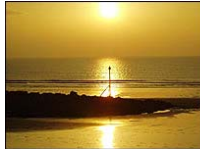
Dinas Dinlle beach

The officer was wakeboarding off Dinas Dinlle beach. A serving officer with North Wales Police has died after being towed by a water bike off a beach near Caernarfon.